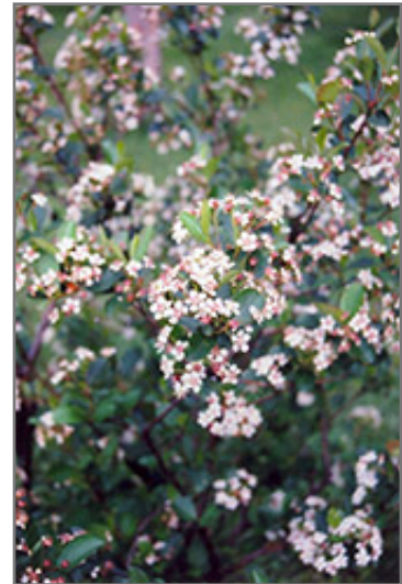
Black Chokeberry flowers

* This is a 'special order' plant - contact store for details