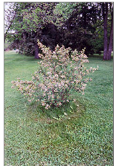
Black Chokeberry in bloom