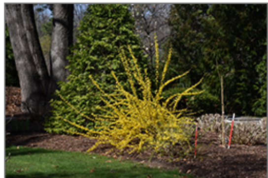
Show Off Forsythia in bloom