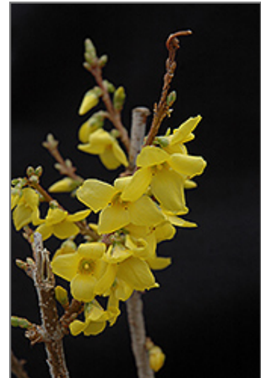
Show Off Forsythia flowers

Show Off Forsythia makes a fine choice for the outdoor landscape, but it is also well-suited for use in outdoor pots and containers. With its upright habit of growth, it is best suited for use as a 'thriller' in the 'spiller-thriller-filler' container combination; plant it near the center of the pot, surrounded by smaller plants and those that spill over the edges. It is even sizeable enough that it can be grown alone in a suitable container. Note that when grown in a container, it may not perform exactly as indicated on the tag - this is to be expected. Also note that when growing plants in outdoor containers and baskets, they may require more frequent waterings than they would in the yard or garden. Be aware that in our climate, most plants cannot be expected to survive the winter if left in containers outdoors, and this plant is no exception. Contact our experts for more information on how to protect it over the winter months.