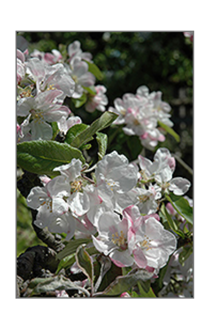
Wealthy Apple flowers

This is a deciduous tree with a more or less rounded form. Its average texture blends into the landscape, but can be balanced by one or two finer or coarser trees or shrubs for an effective composition. This is a high maintenance plant that will require regular care and upkeep, and is best pruned in late winter once the threat of extreme cold has passed. Gardeners should be aware of the following characteristic(s) that may warrant special consideration;