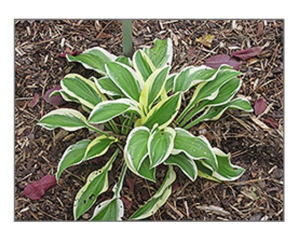
Iron Gate Delight Hosta

Iron Gate Delight Hosta is recommended for the following landscape applications;