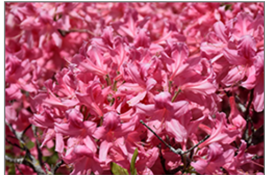
Rosy Lights Azalea flowers

Rosy Lights Azalea is recommended for the following landscape applications;