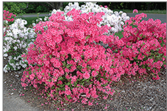
Rosy Lights Azalea in bloom