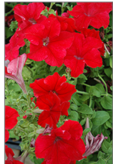
Dreams Red Petunia flowers