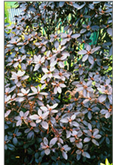
P.J.M. Elite Rhododendron in fall

* This is a 'special order' plant - contact store for details