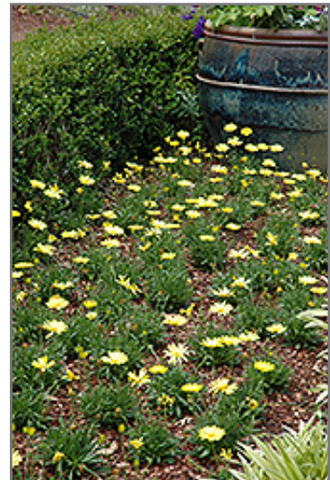
Voltage Yellow African Daisy flowers