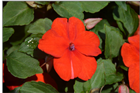
Super Elfin XP Scarlet Impatiens flowers

Super Elfin XP Scarlet Impatiens is recommended for the following landscape applications;