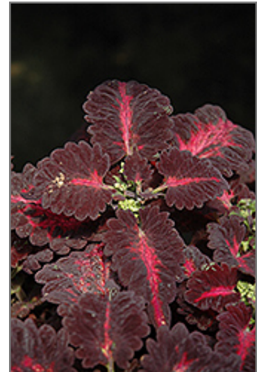
Black Dragon Coleus foliage