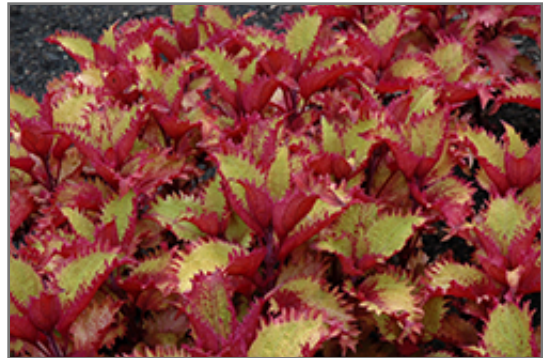
Henna Coleus foliage