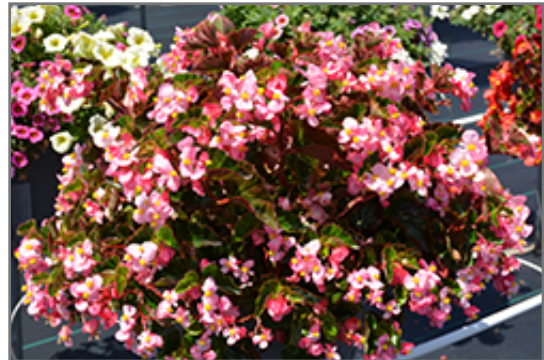
BabyWing Pink Begonia in bloom

BabyWing Pink Begonia is a fine choice for the garden, but it is also a good selection for planting in outdoor containers and hanging baskets. It is often used as a 'filler' in the 'spiller-thriller-filler' container combination, providing a mass of flowers and foliage against which the thriller plants stand out. Note that when growing plants in outdoor containers and baskets, they may require more frequent waterings than they would in the yard or garden.