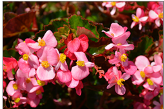
BabyWing Pink Begonia flowers

BabyWing Pink Begonia is an herbaceous annual with a mounded form. Its medium texture blends into the garden, but can always be balanced by a couple of finer or coarser plants for an effective composition.