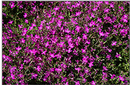
Techno Violet Lobelia flowers

Techno Violet Lobelia is a fine choice for the garden, but it is also a good selection for planting in hanging baskets. Because of its trailing habit of growth, it is ideally suited for use as a 'spiller' in the 'spiller-thriller-filler' container combination; plant it near the edges where it can spill gracefully over the pot. Note that when growing plants in outdoor containers and baskets, they may require more frequent waterings than they would in the yard or garden.