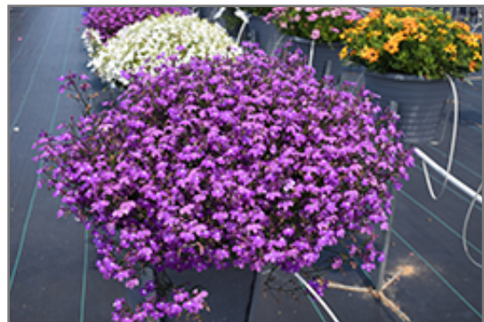
Techno Violet Lobelia in bloom