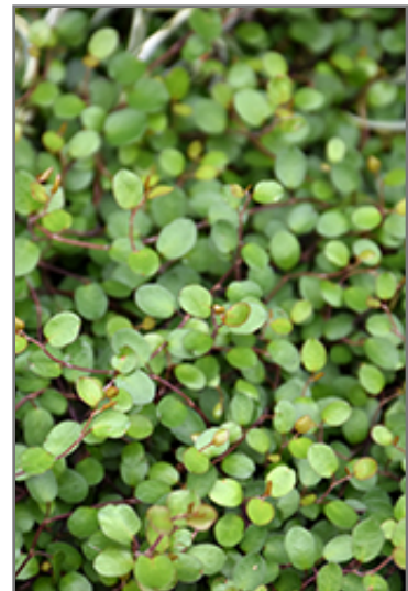
Creeping Wire Vine foliage