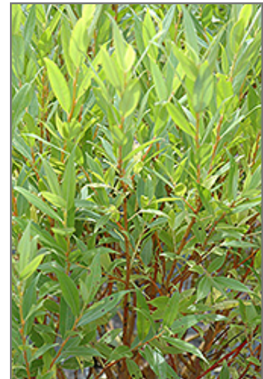
Flame Willow foliage