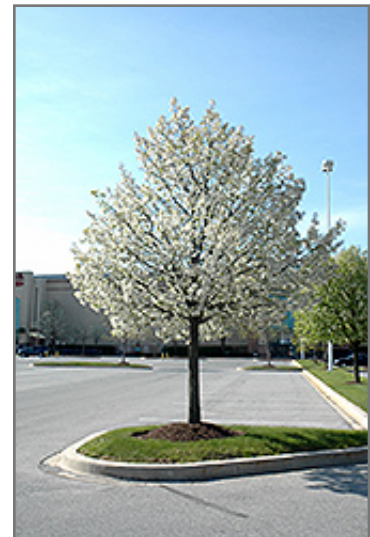
Jack Ornamental Pear in bloom