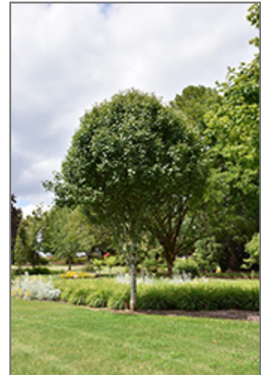
Jack Ornamental Pear

* This is a 'special order' plant - contact store for details