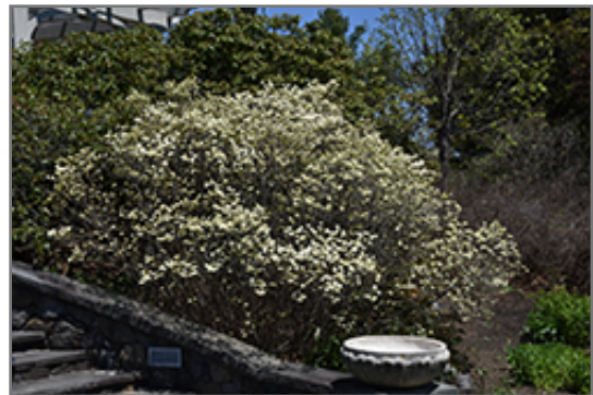
Dwarf Fothergilla in bloom