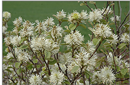
Dwarf Fothergilla flowers

Dwarf Fothergilla will grow to be about 3 feet tall at maturity, with a spread of 3 feet. It tends to fill out right to the ground and therefore doesn't necessarily require facer plants in front. It grows at a slow rate, and under ideal conditions can be expected to live for 40 years or more.