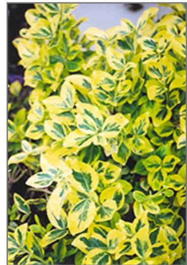
Sungold Wintercreeper foliage

Sungold Wintercreeper is recommended for the following landscape applications;