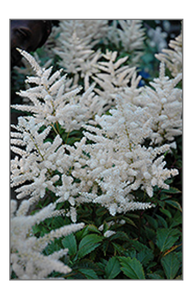
Deutschland Astilbe flowers

This is a relatively low maintenance plant, and is best cleaned up in early spring before it resumes active growth for the season. It is a good choice for attracting butterflies to your yard, but is not particularly attractive to deer who tend to leave it alone in favor of tastier treats. It has no significant negative characteristics.