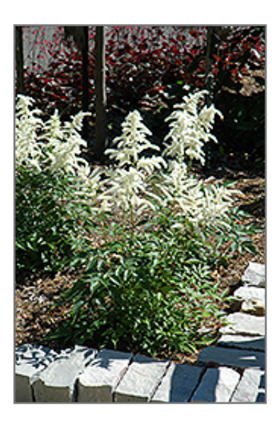
Deutschland Astilbe in bloom