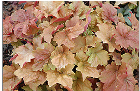
Dolce Creme Brulee Coral Bells foliage

This is a relatively low maintenance plant, and should be cut back in late fall in preparation for winter. It is a good choice for attracting hummingbirds to your yard. It has no significant negative characteristics.