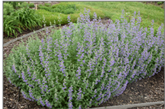
Walker's Low Catmint in bloom

Walker's Low Catmint is recommended for the following landscape applications;