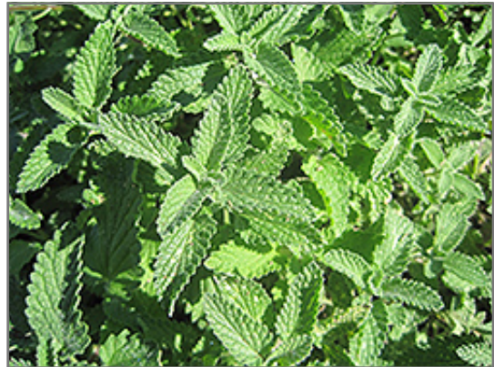
Walker's Low Catmint foliage

Walker's Low Catmint will grow to be about 12 inches tall at maturity extending to 16 inches tall with the flowers, with a spread of 12 inches. Its foliage tends to remain dense right to the ground, not requiring facer plants in front. It grows at a fast rate, and under ideal conditions can be expected to live for approximately 10 years. As an herbaceous perennial, this plant will usually die back to the crown each winter, and will regrow from the base each spring. Be careful not to disturb the crown in late winter when it may not be readily seen!