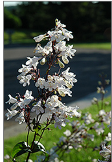
Husker Red Beard Tongue flowers

Husker Red Beard Tongue is recommended for the following landscape applications;