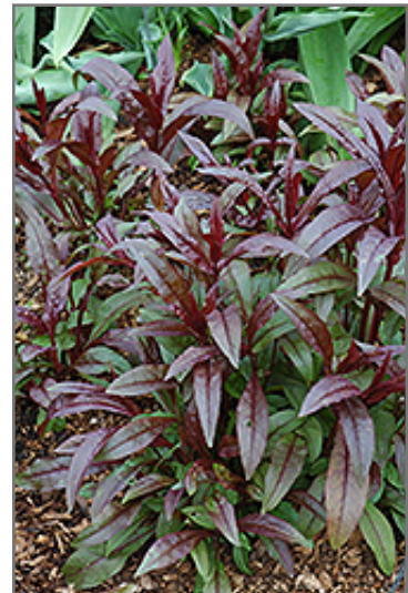
Husker Red Beard Tongue foliage