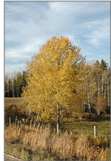
Trembling Aspen in fall

This tree should only be grown in full sunlight. It is an amazingly adaptable plant, tolerating both dry conditions and even some standing water. It is considered to be drought-tolerant, and thus makes an ideal choice for xeriscaping or the moisture-conserving landscape. It is not particular as to soil type or pH. It is quite intolerant of urban pollution, therefore inner city or urban streetside plantings are best avoided. This species is native to parts of North America.