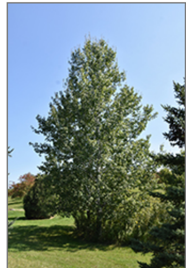
Trembling Aspen