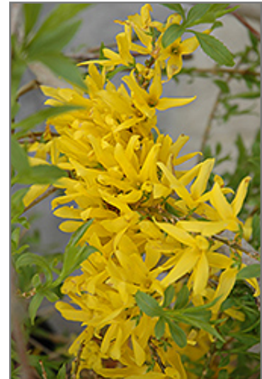
Gold Tide Forsythia flowers

Gold Tide Forsythia is recommended for the following landscape applications;