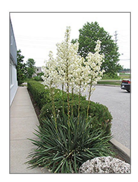
Adam's Needle in bloom