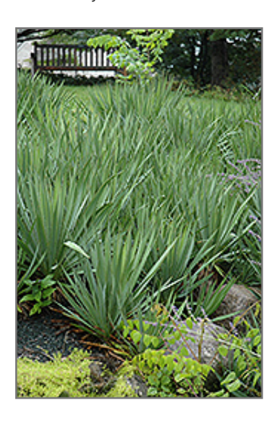
Adam's Needle