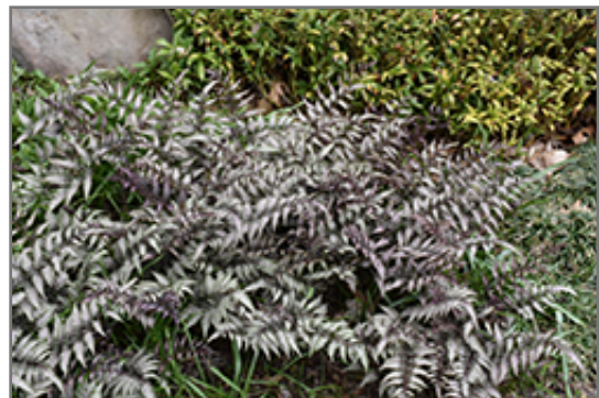
Pewter Lace Painted Fern