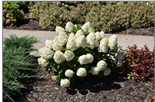
Little Lime Punch Hydrangea in bloom

Little Lime Punch Hydrangea makes a fine choice for the outdoor landscape, but it is also well-suited for use in outdoor pots and containers. With its upright habit of growth, it is best suited for use as a 'thriller' in the 'spiller-thriller-filler' container combination; plant it near the center of the pot, surrounded by smaller plants and those that spill over the edges. It is even sizeable enough that it can be grown alone in a suitable container. Note that when grown in a container, it may not perform exactly as indicated on the tag - this is to be expected. Also note that when growing plants in outdoor containers and baskets, they may require more frequent waterings than they would in the yard or garden. Be aware that in our climate, most plants cannot be expected to survive the winter if left in containers outdoors, and this plant is no exception. Contact our experts for more information on how to protect it over the winter months.