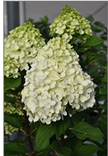
Little Lime Punch Hydrangea flowers

Little Lime Punch Hydrangea is recommended for the following landscape applications;