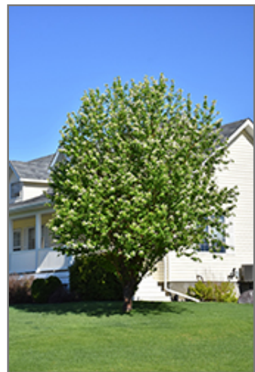
Amur Cherry