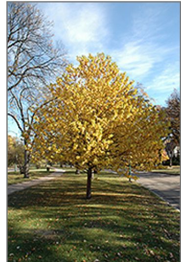
Amur Cherry in fall

* This is a 'special order' plant - contact store for details