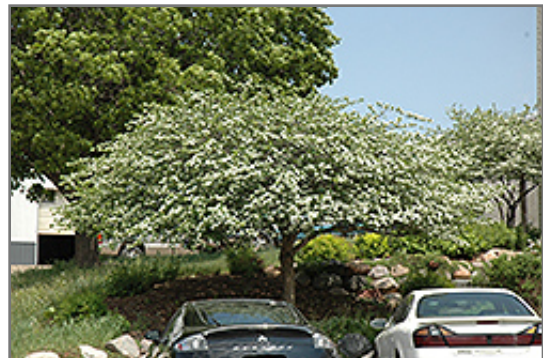
Thornless Cockspur Hawthorn in bloom