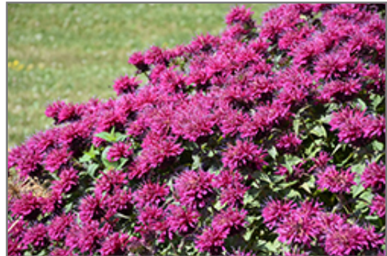
Grand Marshall Beebalm flowers