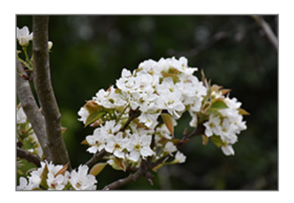
20th Century Pear flowers