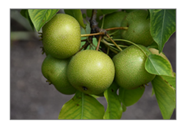
20th Century Pear fruit

20th Century Pear is clothed in stunning clusters of white flowers with purple anthers along the branches in early spring before the leaves. It has dark green deciduous foliage. The glossy pointy leaves turn an outstanding tomato-orange in the fall. The fruits are showy yellow pears with hints of red, which are carried in abundance in late summer. The fruit can be messy if allowed to drop on the lawn or walkways, and may require occasional clean-up.