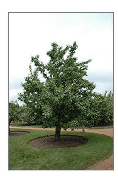
20th Century Pear