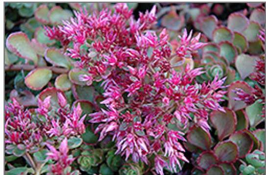
Fulda Glow Stonecrop flowers