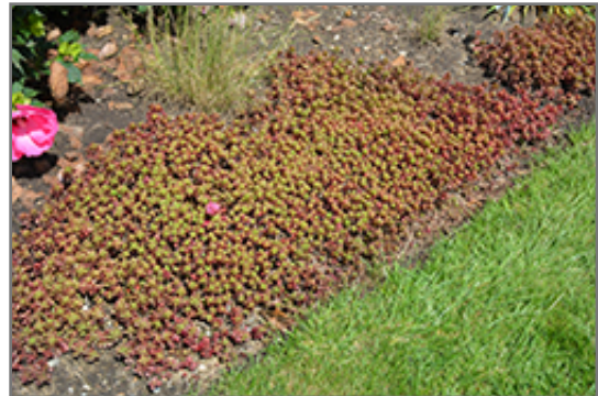
Fulda Glow Stonecrop