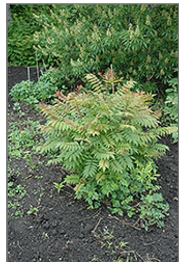
Sem False Spirea