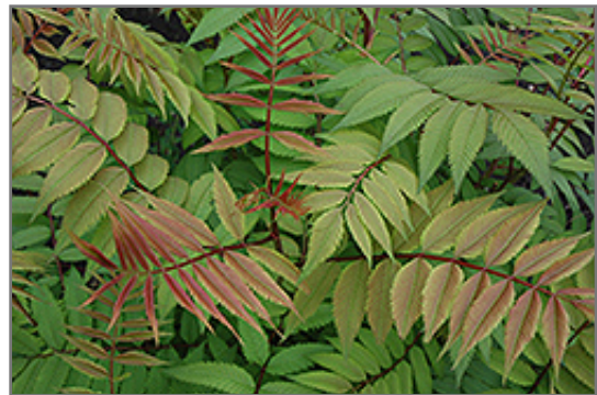
Sem False Spirea foliage

Sem False Spirea is a multi-stemmed deciduous shrub with a more or less rounded form. Its average texture blends into the landscape, but can be balanced by one or two finer or coarser trees or shrubs for an effective composition.