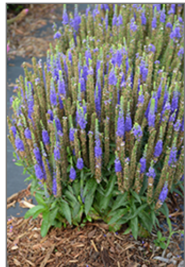
Royal Candles Speedwell in bloom