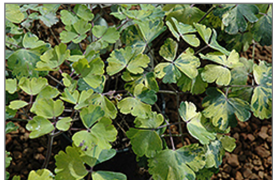
Leprechaun Gold Columbine foliage