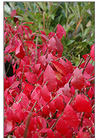
Burning Bush (tree form) in fall