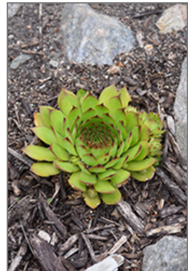
Sunset Hens And Chicks

Sunset Hens And Chicks is recommended for the following landscape applications;