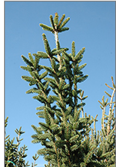
Columnar Norway Spruce foliage