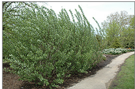
French Pussy Willow