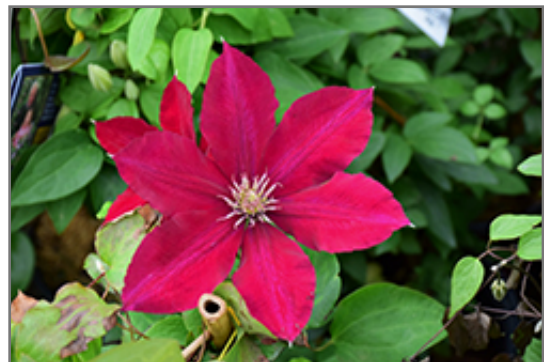
Rebecca Clematis flowers