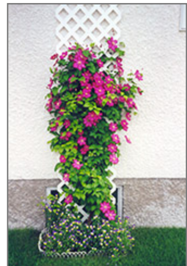
Ville de Lyon Clematis in bloom