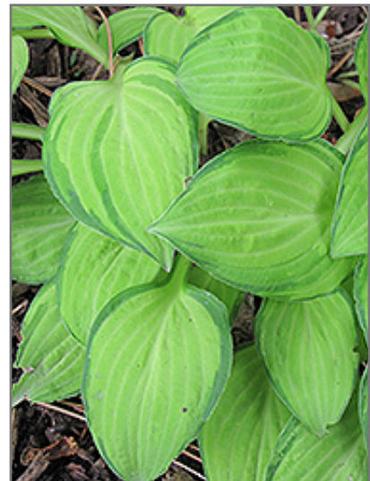
Emerald Tiara Hosta foliage