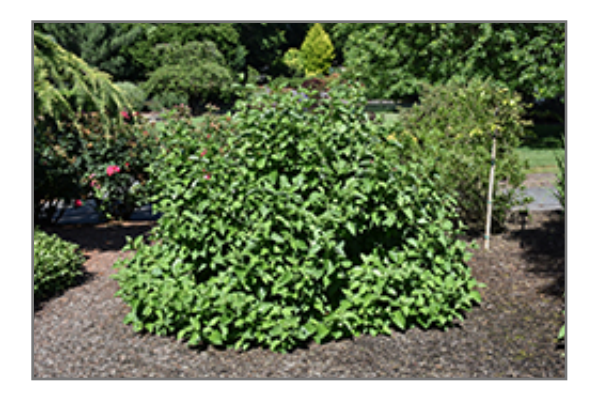
Isanti Dogwood

Idaho Falls: 5800 So Yellowstone Hwy (208) 522-5247 Pocatello: 1300 East Oak Street (208) 232-7985 www.tcgardens.com