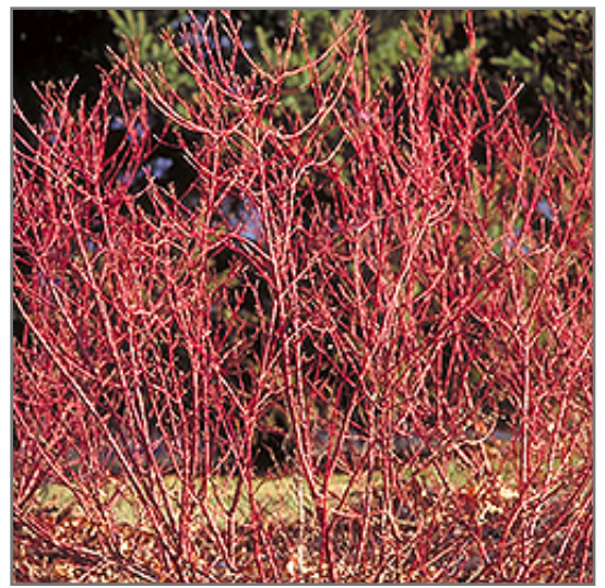
Isanti Dogwood in winter