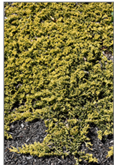
Mother Lode Juniper foliage