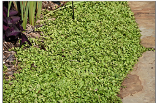
Creeping Mazus

Creeping Mazus will grow to be only 2 inches tall at maturity extending to 3 inches tall with the flowers, with a spread of 12 inches. Its foliage tends to remain low and dense right to the ground. It grows at a fast rate, and under ideal conditions can be expected to live for approximately 10 years. As an evergreen perennial, this plant will typically keep its form and foliage year-round.