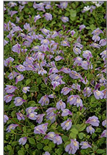
Creeping Mazus flowers