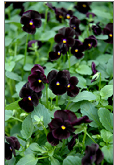
Sorbet Black Delight Pansy flowers

Sorbet Black Delight Pansy is an herbaceous perennial with a mounded form. Its relatively fine texture sets it apart from other garden plants with less refined foliage.