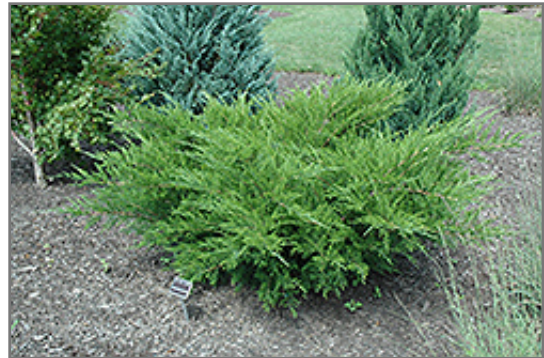
Sea Green Juniper

Sea Green Juniper is recommended for the following landscape applications;