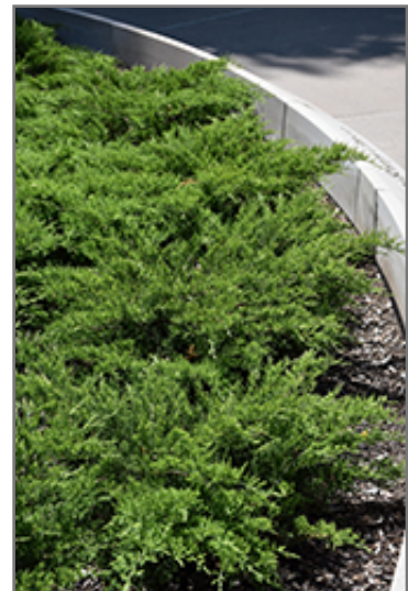
Broadmoor Juniper