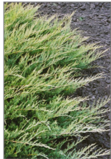
Broadmoor Juniper foliage