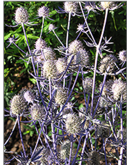
Jade Frost Variegated Sea Holly flowers

Jade Frost Variegated Sea Holly is a fine choice for the garden, but it is also a good selection for planting in outdoor pots and containers. It can be used either as 'filler' or as a 'thriller' in the 'spiller-thriller-filler' container combination, depending on the height and form of the other plants used in the container planting. Note that when growing plants in outdoor containers and baskets, they may require more frequent waterings than they would in the yard or garden. Be aware that in our climate, most plants cannot be expected to survive the winter if left in containers outdoors, and this plant is no exception. Contact our experts for more information on how to protect it over the winter months.