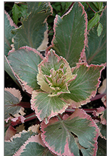
Jade Frost Variegated Sea Holly foliage