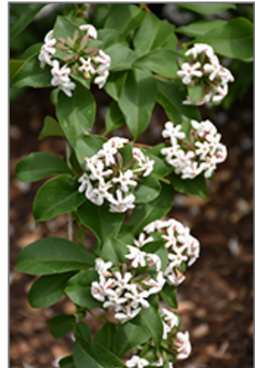
Fragrant Abelia flowers

This shrub will require occasional maintenance and upkeep, and should only be pruned after flowering to avoid removing any of the current season's flowers. It is a good choice for attracting birds, bees and butterflies to your yard, but is not particularly attractive to deer who tend to leave it alone in favor of tastier treats. It has no significant negative characteristics.