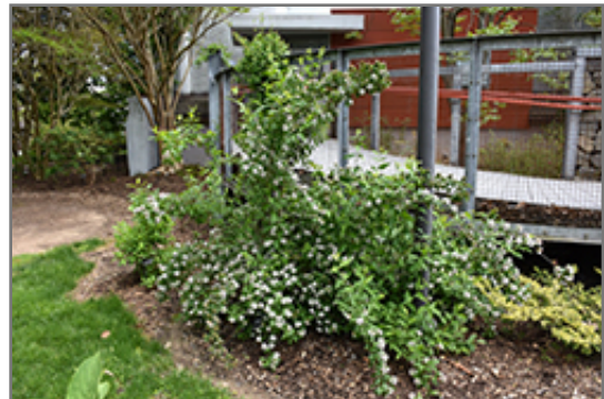
Fragrant Abelia in bloom